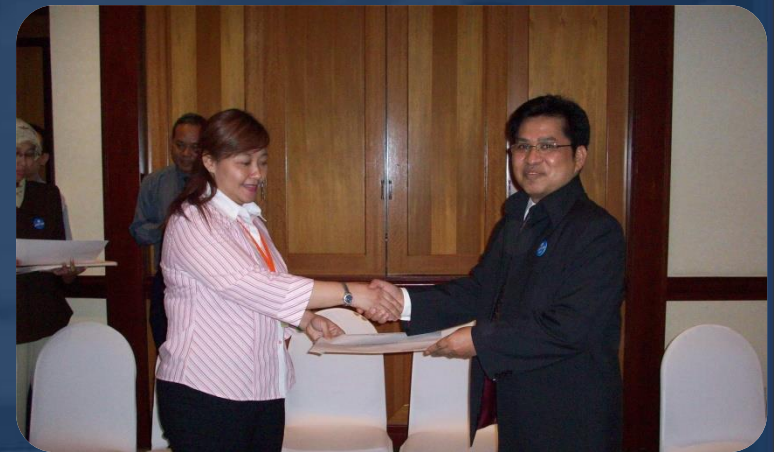
PUBLIC TRAINING BERSAMA DIREKTUR MASPION GROUP