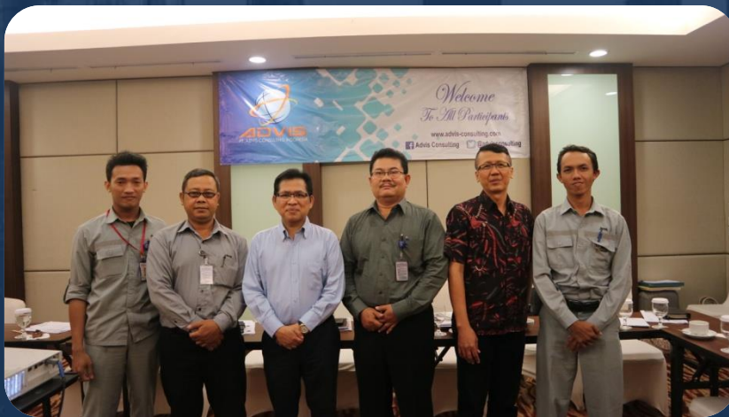
SEMINAR “PENINGKATAN EFISIENSI & PRODUKTIVITAS” bersama PT Barata Indonesia