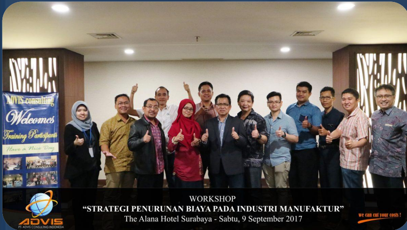
WORKSHOP “STRATEGI PENURUNAN BIAYA PADA INDUSTRI MANUFAKTUR”, The Alana Hotel Surabaya