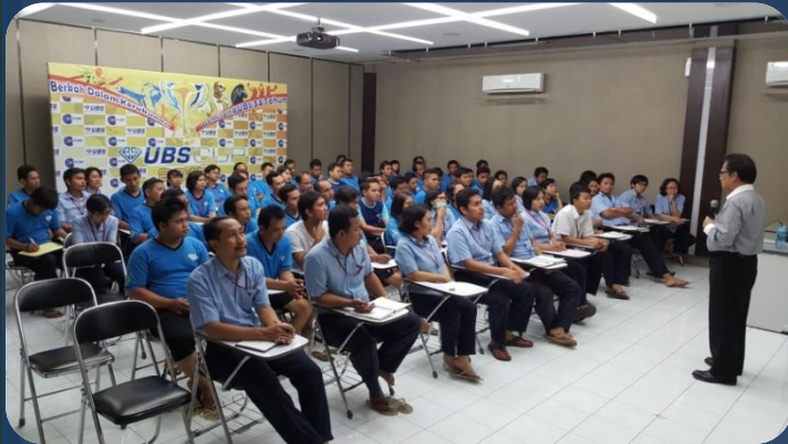
IN HOUSE TRAINING “TRAINING MOTIVASI” di PT Untung Bersama Sejahtera, Surabaya